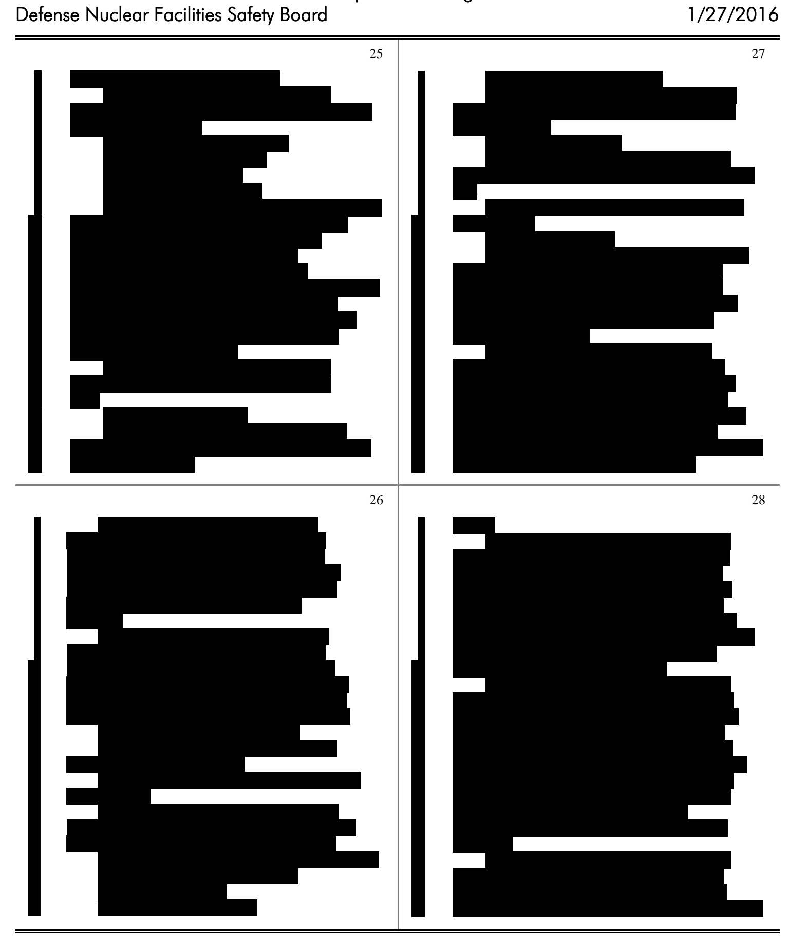
7 (Pages 25 to 28)